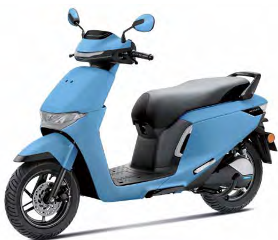
Pearl Serenity Blue